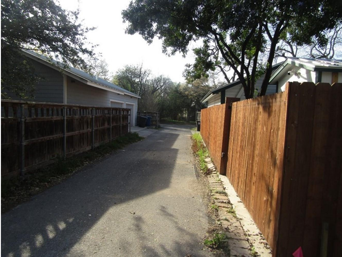
Similar Nearby Structure